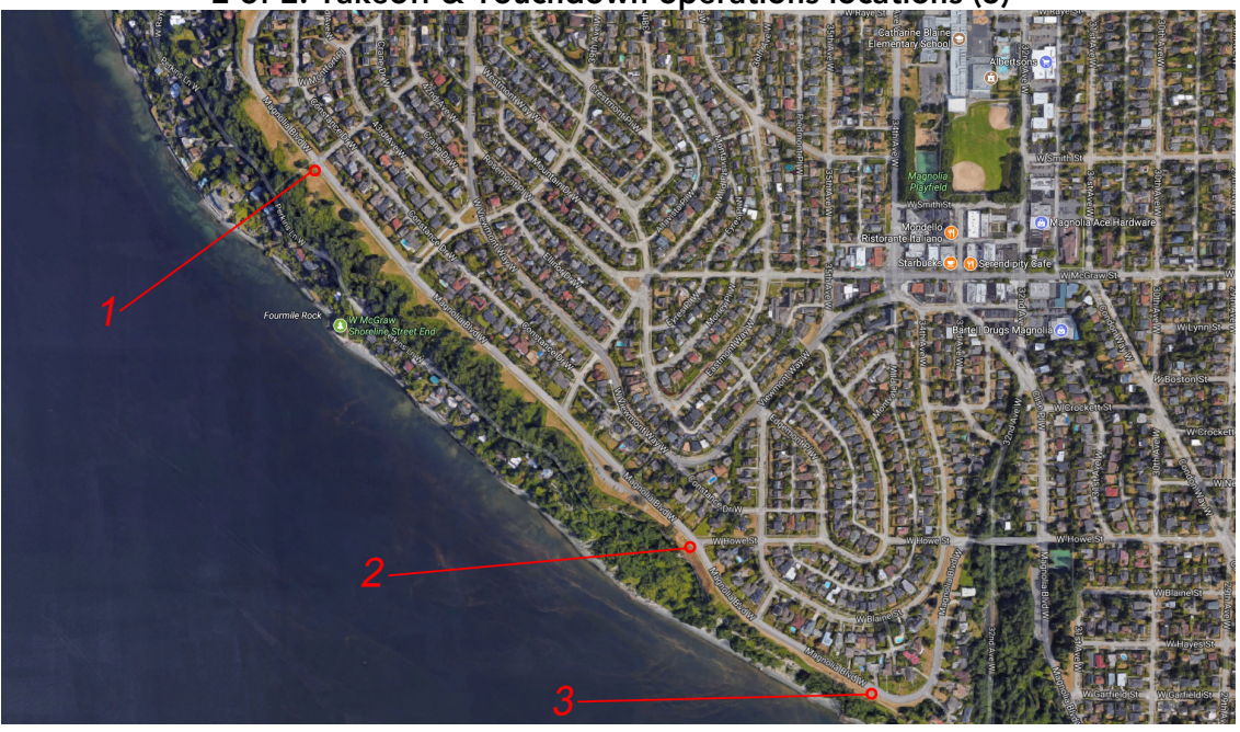
2 of 2: Takeoff & Touchdown operations locations (3)